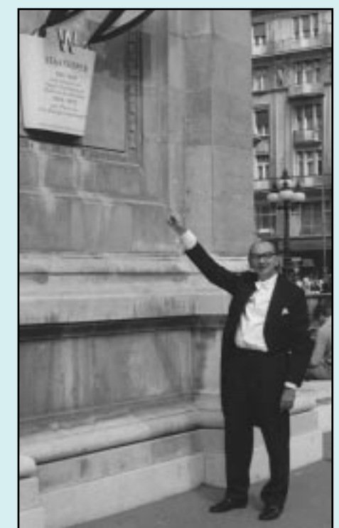
Outside the Opera House, Vienna (1982)