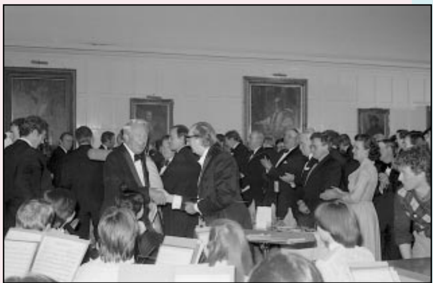
Pictured with Ted Heath MP at the 10th Ann. of the EEC at Q.U.B, Belfast.