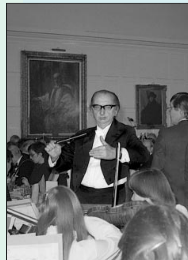
Conducting the SUYO IN Queens University Belfast at the 10th Anniversary of the EEC (1983)